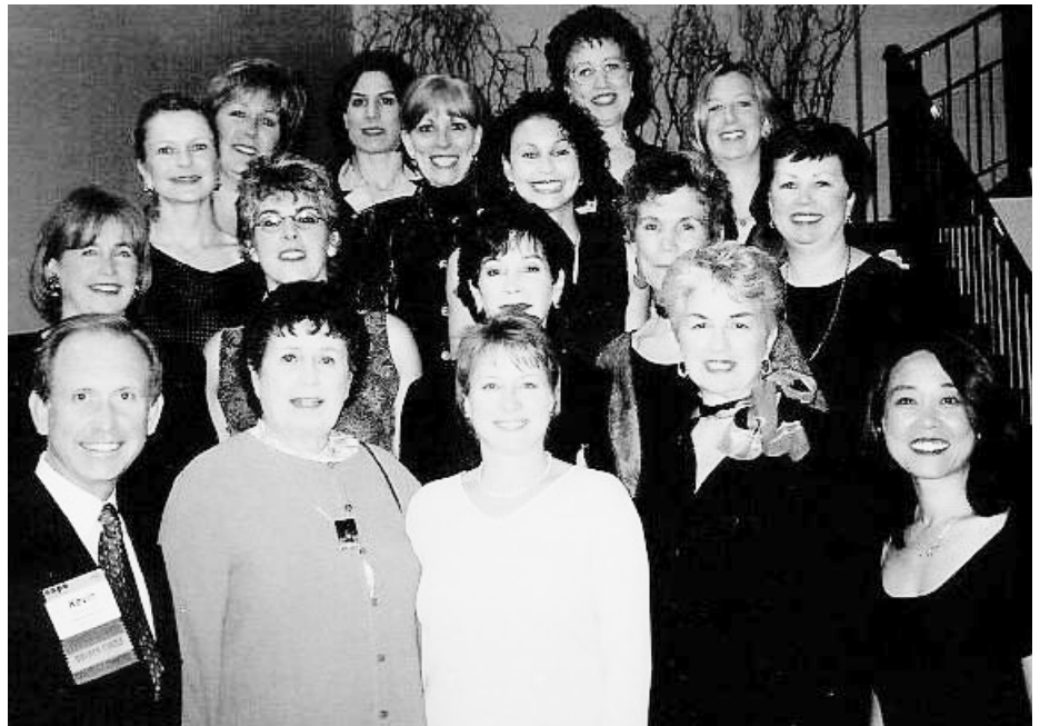
Happy Conference 2002 attendees sending big smiles back to the rest of us.